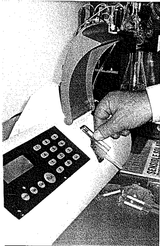
Gibertini's Nucleo Counter, a fluorescent microscope to count total and non-viable yeast cells in less than a minute, may be a valuable fermentation tracking tool.